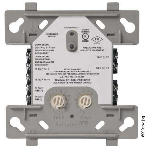
FMM-1(A) (Type H)

Use to monitor a zone of four-wire smoke detectors, manual fire alarm pull stations, waterflow devices, or other normally-open dry-contact alarm activation devices. May also be used to monitor normally-open supervisory devices with special supervisory indication at the control panel. Monitored circuit may be wired as an NFPA Style B (Class B) or Style D (Class