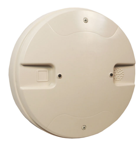
W-GATE Wireless System Gateway